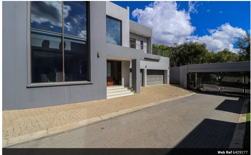
Web Ref 6429277

Shop 2B Northlands Corner Corner Witkoppen Road and Newmarket Street North Riding Randburg