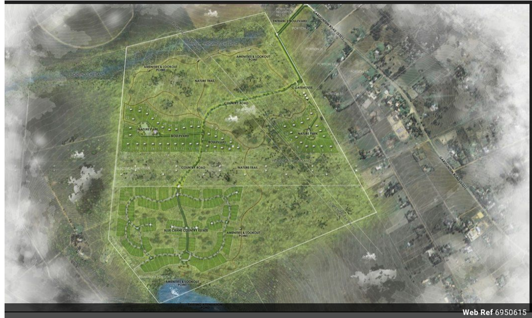
Web Ref 6950615