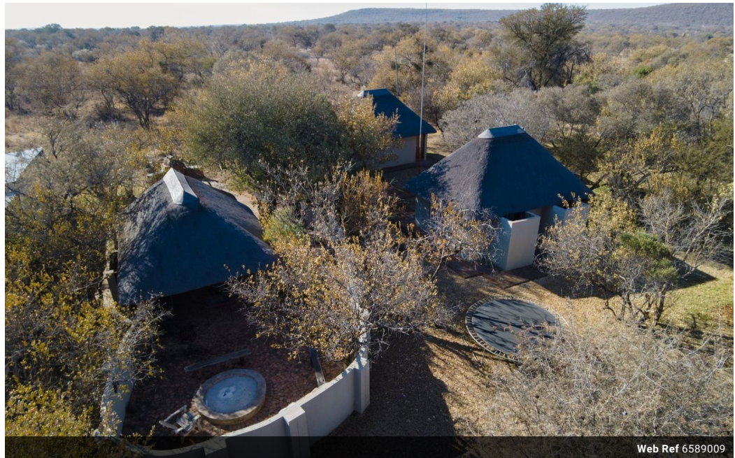
Web Ref 6589009