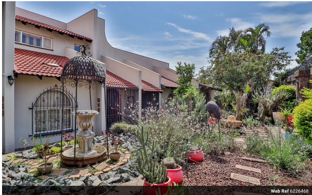
Web Ref 6226468