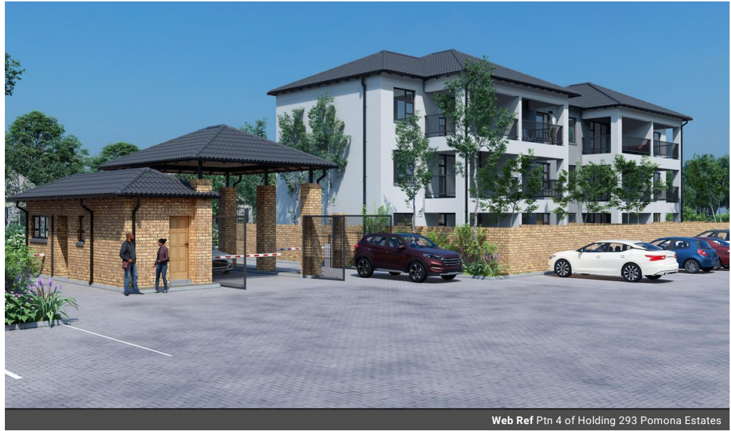
Web Ref Ptn 4 of Holding 293 Pomona Estates